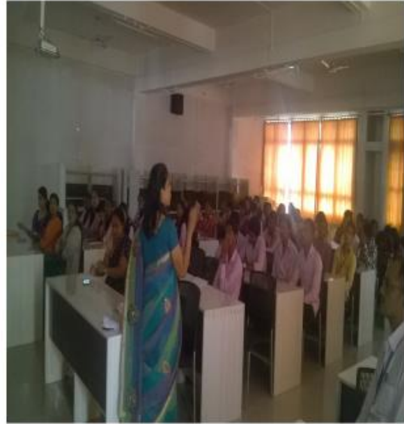
MoU: Workshop on Stress Management at RIT, Islampur