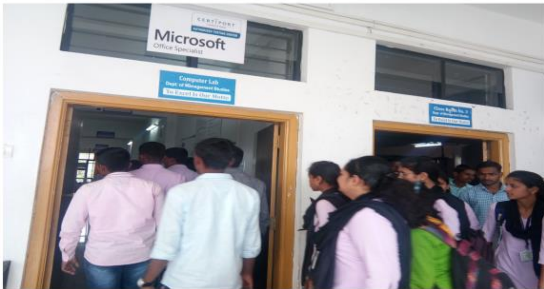
MoU: Visit to Microsoft Certification Centre at RIT, Islampur