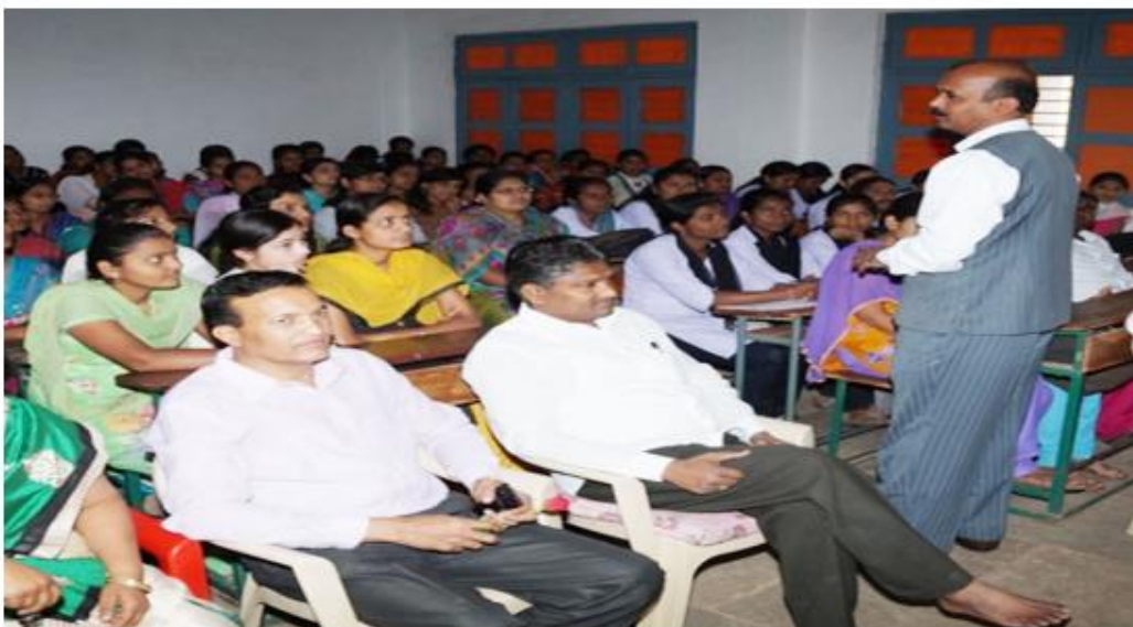
(One day workshop on Career Opportunities in Commerce under Lead College Scheme)