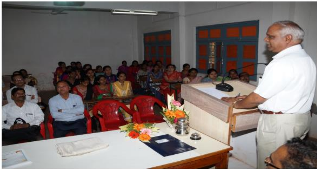
One Day Workshop on Revised Syllabus of B. Com. III Advanced Accountancy P. II & IV