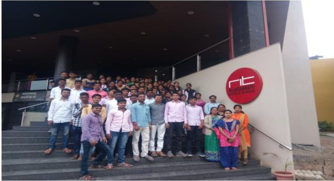
Industrial Tour: Visit to Management Institute RIT, Islampur