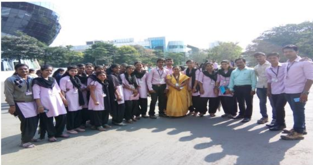
Industrial Tour: Infosys Company, Pune