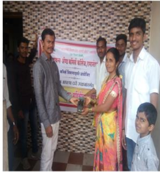
STEP: Training & Information Campaign on cashless rural economy