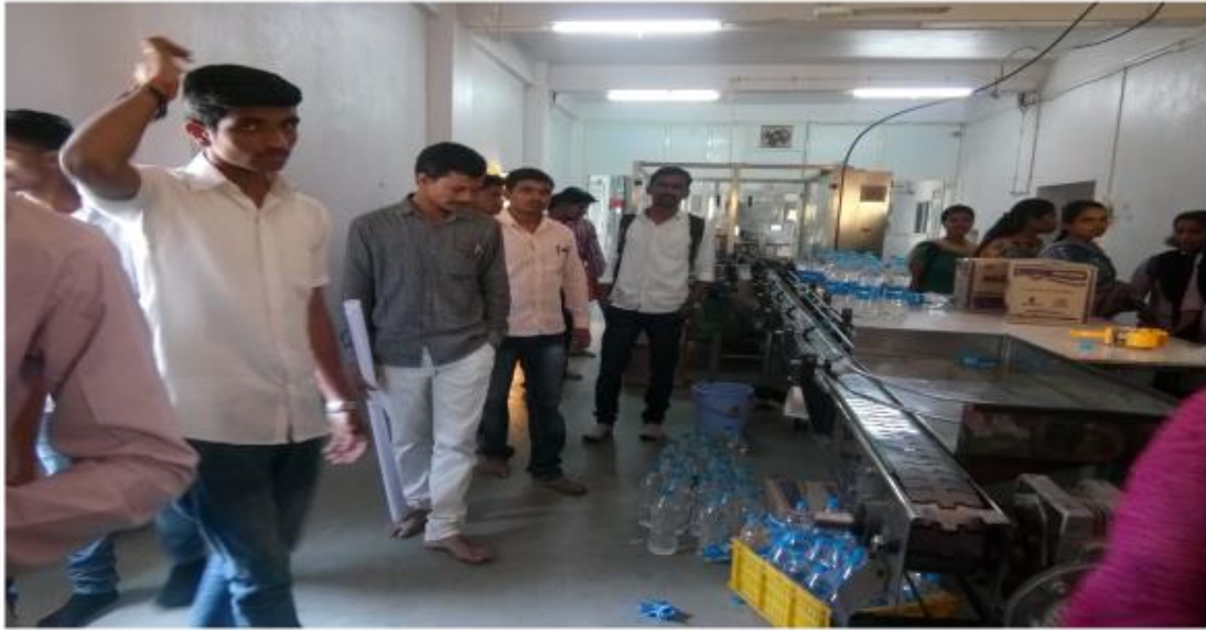
Industrial Visit: Krushna Minerals Dudhondi