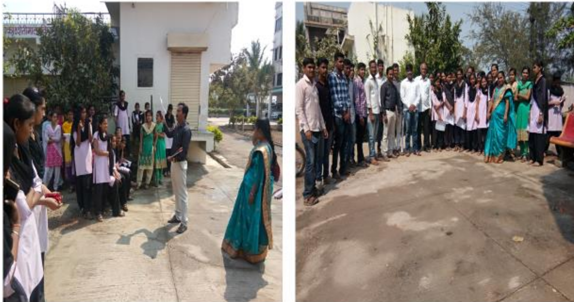
Village Survey on Demonetization & its impact on Palus Taluka