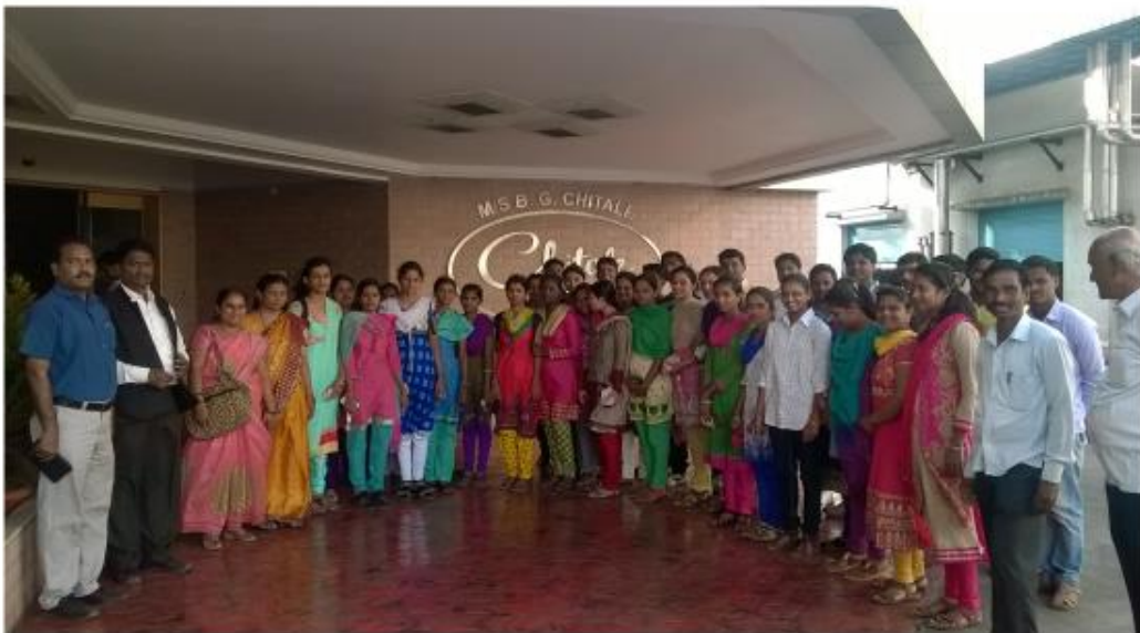
Industrial Tour: Visit to Chitale Dairy, Bhilawadi