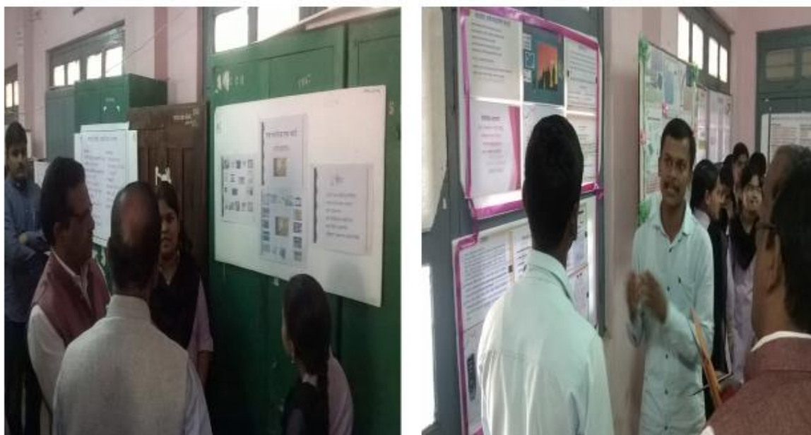
Poster Presentation by Department Students in Avishkar Competition