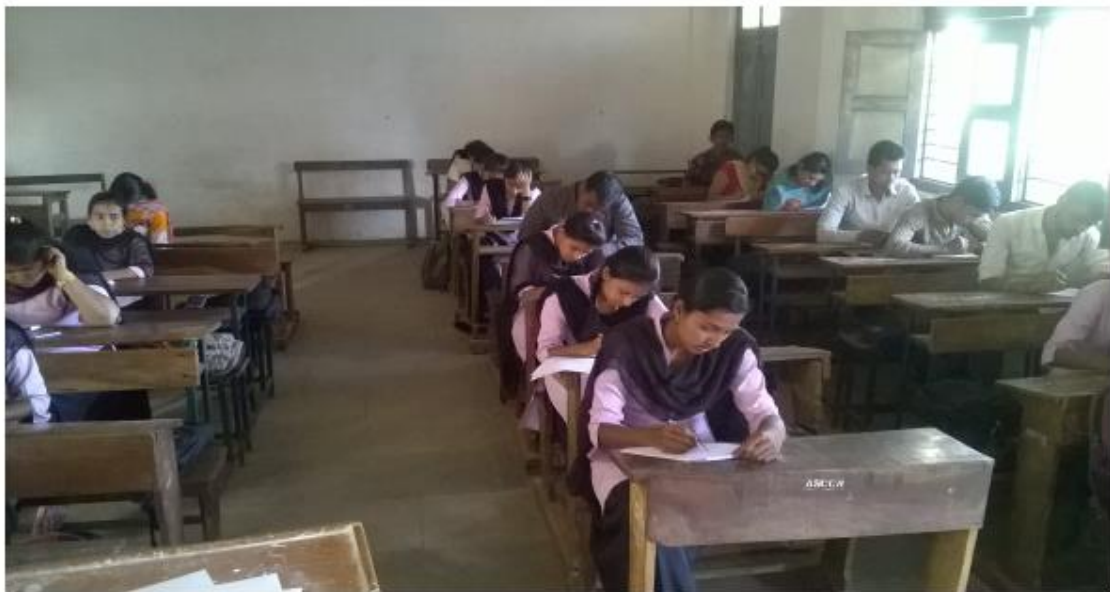
Commerce Talent Search Competition-(SUCOMATA)