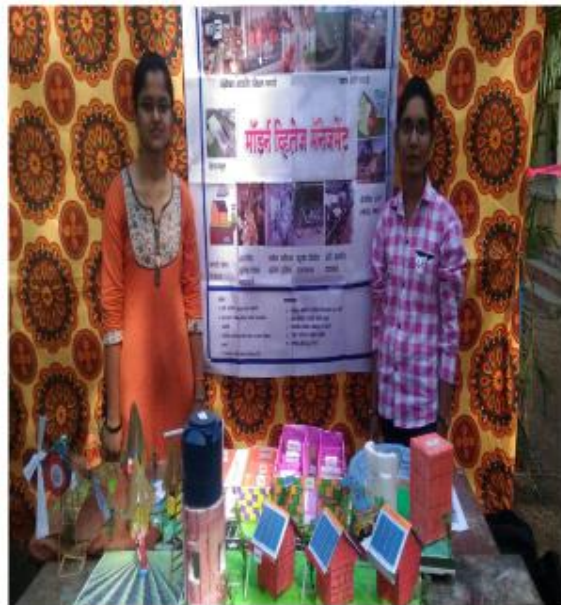
Model Presentation by Dept. Students in Avishkar Research Competition