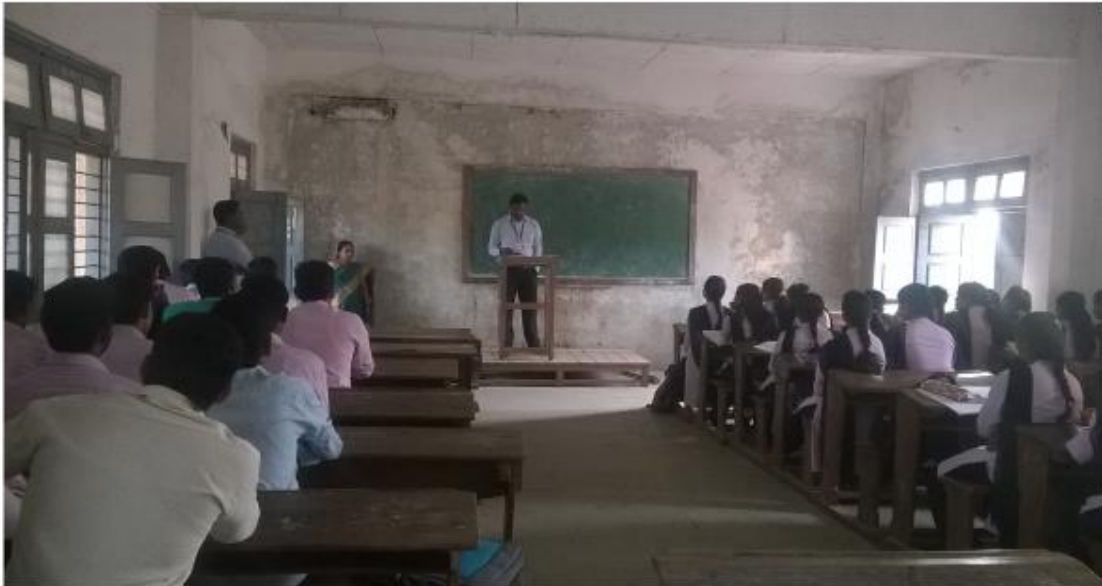
Guest Lecture on Digital India and Banking by Manager ICICI Bank, Branch Ramanandnagar