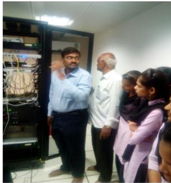
MoU: Understanding Banking Procedure at Mansing Bank, Dudhondi