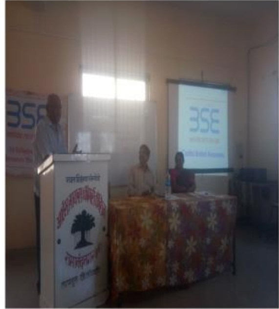
Workshop on Capital Market Awareness