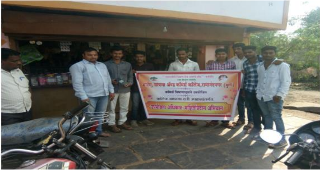
Consumer Rights: Awareness Campaign