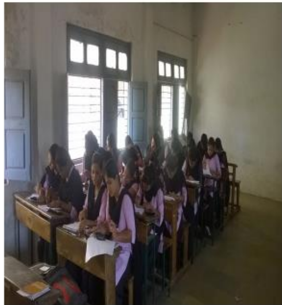
Surprize Test of Advanced Accountancy P. I